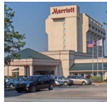
Cleveland Airport Marriott Hotel 4277 West 150th Street Cleveland

Social time in the lounge at 5:30 p.m., Dinner/Meeting at 6:00 p.m.