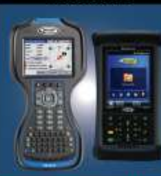
Ranger 3/Nomad 1050

Survey Standard COGO Suite as well as traverse, sideshot and staking routines