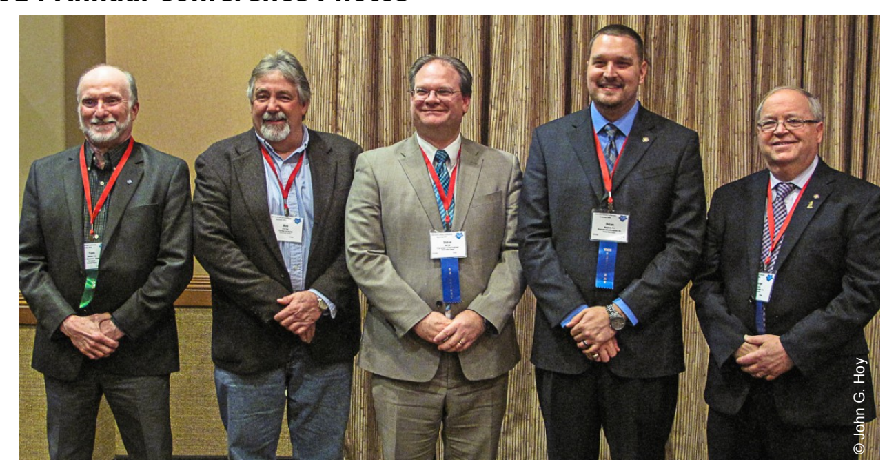
Above: 2014 PLSO Officers