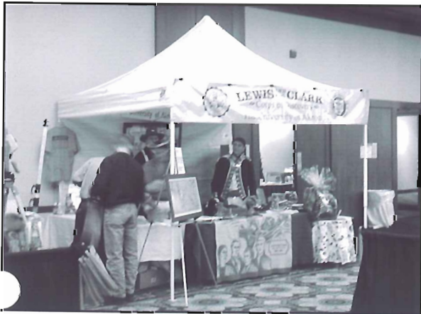
The University of Akron Student Chapter's "Lewis & Clark" encampment in the exhibits hall