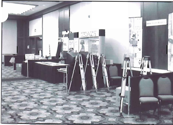
Exhibit Hall ready for Thursday morning kickoff