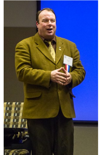
Dignitaries from the Annual Meeting.