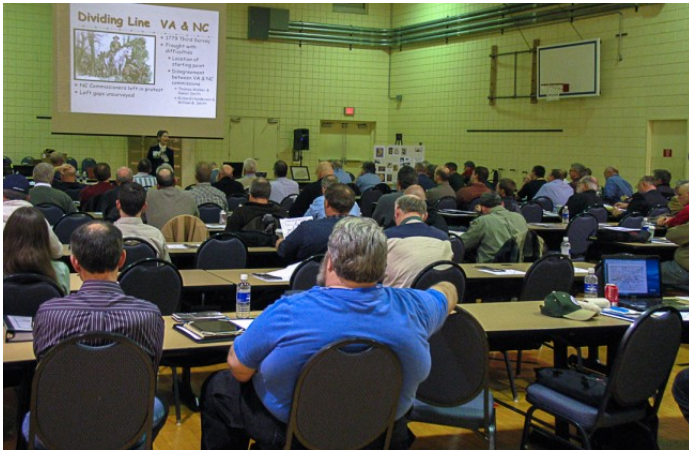
The largest session was held in the gymnasium.

Photos from the 2012 Annual Conference, Columbus: