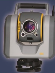
SX10 Scan. Total Station