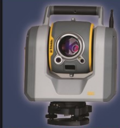
SX10 Scan. Total Station