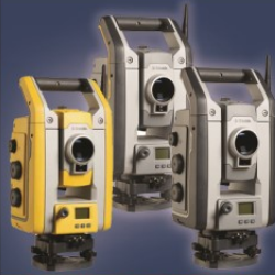
Robotic Total Stations