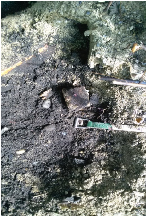
Hub & tack set 7' off corner