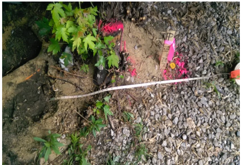
Corner pin now 2.72 feet off original hub & tack