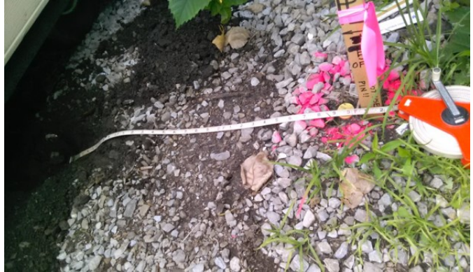
Current position of pin now 3' from where we set it