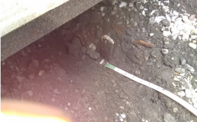
Base of stake formerly set next to original pin position 2' off rear p/l (Under rear adjoiners' camper)