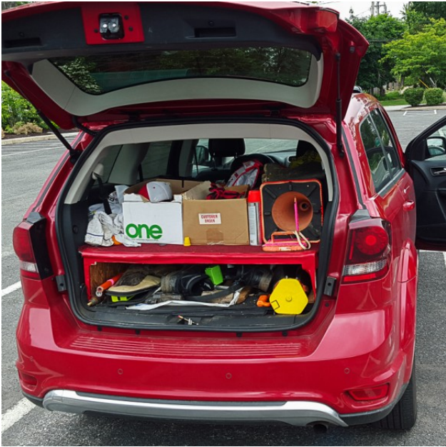
Bill Welsh's survey vehicle, including golf clubs.