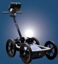
Quantum Series GPR